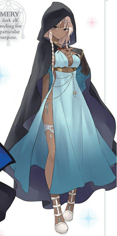
EMERY A dark elf. Traveling for a particular purpose.